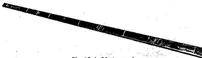
Fig 12.1: Meter rod

It is the standard unit of length. Symbol m is used for meter. Metre is the distance travelled by light in vacuum in about 300 millionth of a second.