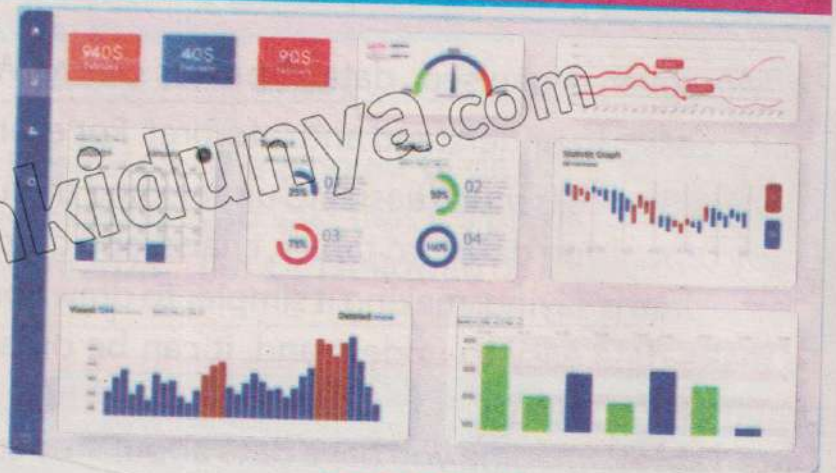
Fig 9.2 Graphs